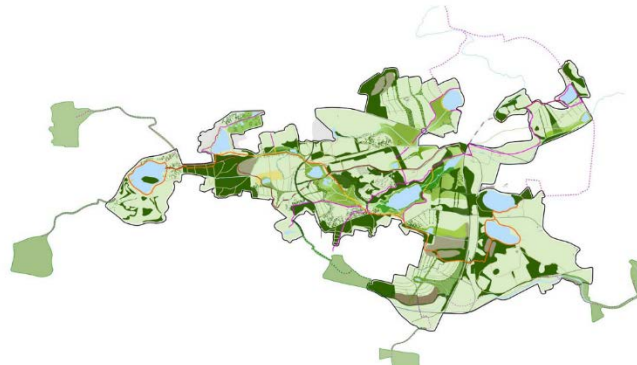
Figure 2 Construction concept and actual case diagram of “Park City”

In most cities in China, there is a problem of “one thousand cities” in planning and construction. Blindly copying other garden works and destroying the original local characteristics, resulting in the gradual loss of the inherent historical context of the city, it is necessary to attach importance to and respect regional culture in modern cities. The application in the park city, as shown in Figure 2 below, is the actual case in the construction of the city park: